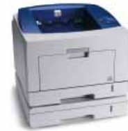
Phaser 3435 shown with optional Tray 2