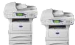
MFC-8440 With / without lower tray