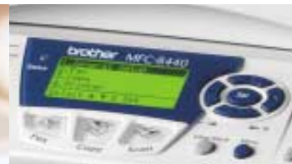
A large, five line backlit display Helps make operation simple – as do the clear instructions it shows