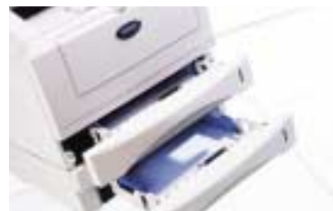
Optional lower tray (LT5000)