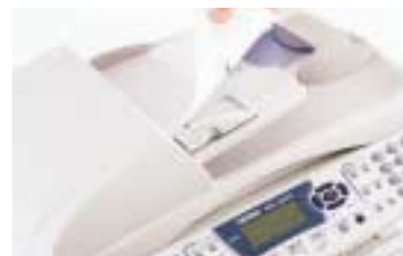
50 sheet automatic document feeder For easy faxing of multi-page documents