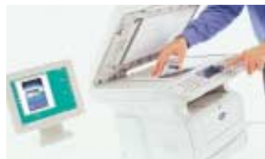
Colour Flatbed scanning Send images directly to OCR, E-mail, Image or File